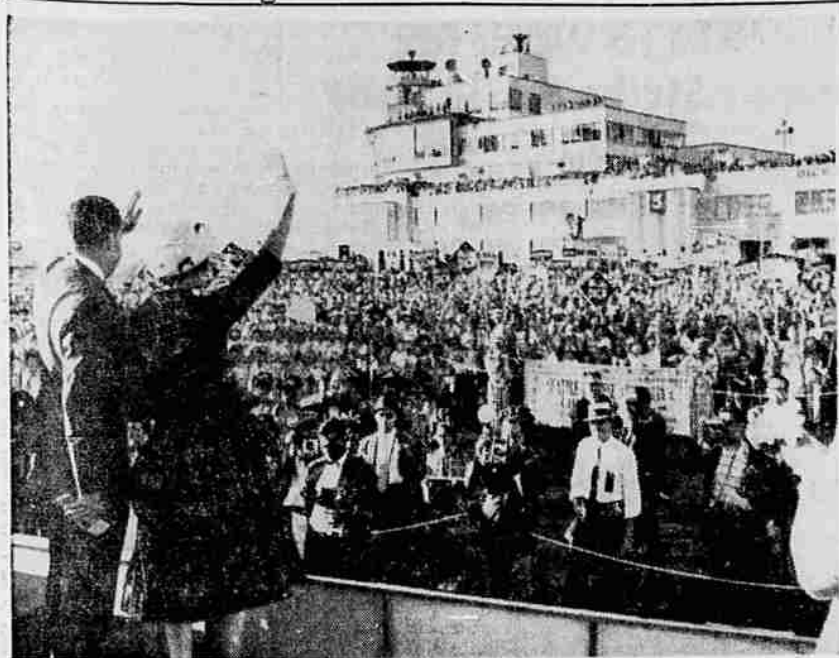
WELCOME HOME —Dick and Pat Nixon home from Hawaii. The Republican Presidential nominee had been in Hawaii on a campaign tour.