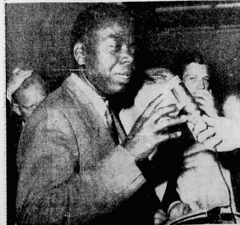
KATANGA'S PREMIER —Moise Tschombe, premier of the Congo's Katanga province, talks to newsmen in Elisabethville after a meeting with Dr. Ralph Bunche, United Nations undersecretary. Katanga virtually sealed itself from the outside world Saturday and pressed plans to confirm its independence.

They do not expect a court decision until after Congress adjourns. This would postpone any legislative action until next January.