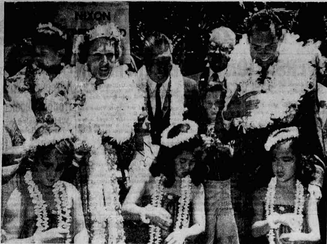
NIXON ARRIVES IN HAWAII —Vice President and Mrs. Richard M. Nixon and Sen. Hiram Fong (R-Hawaii) pose with little hula girls on their arrival from Los Angeles to open a nationwide presidential campaign in Honolulu.

Washington—UPI—The Civil Rights Commission announced today that it will hold a hearing in Louisiana on complaints of Negroes that they were denied the right to register since the Supreme Court ruled last June that the commission does not have to permit cross examination or confrontation of witnesses at its hearings. A spokesman said the commission decided today to hold hearings on Sept. 27 and 28 at a place still to be determined, and that at least 13, and probably more, parishes will be involved. The spokesman said com-