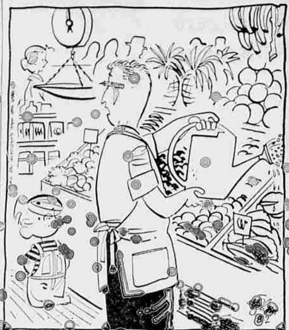
I FEEL FOR YOU, PAPA, BUT I CAN'T HIDE ALL MY TURNIPS JUST BECAUSE YOUR MOTHER MIGHT BUY SOME!