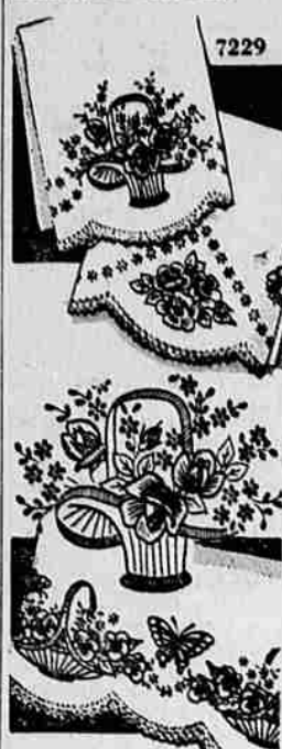
7229 by Alice Brooks

Right from the garden onto your linens, these colorful flowers. Fun to embroider. These flower-filled baskets give your linens the touch that makes them lovely. Embroider in natural colors. Pattern 7229; transfer 6 motifs 3 1/2 x 1 1/2 inches.