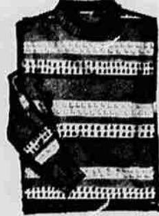
washfast knit shirt

Two ply cotton crew neck knit shirt in blue, tan or brown. Hemmed bottom. Sizes 4-10.