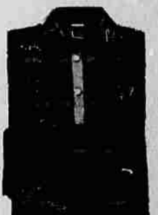
collared knit shirt

Highest styles, newest cotton fabrics, die cut over Sears patterns. Assorted colors. Sizes 12 to 18.