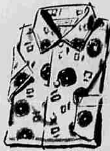
short sleeve shirts

Broadcloth shirts in assorted styles and colors. Sizes 12 to 18.