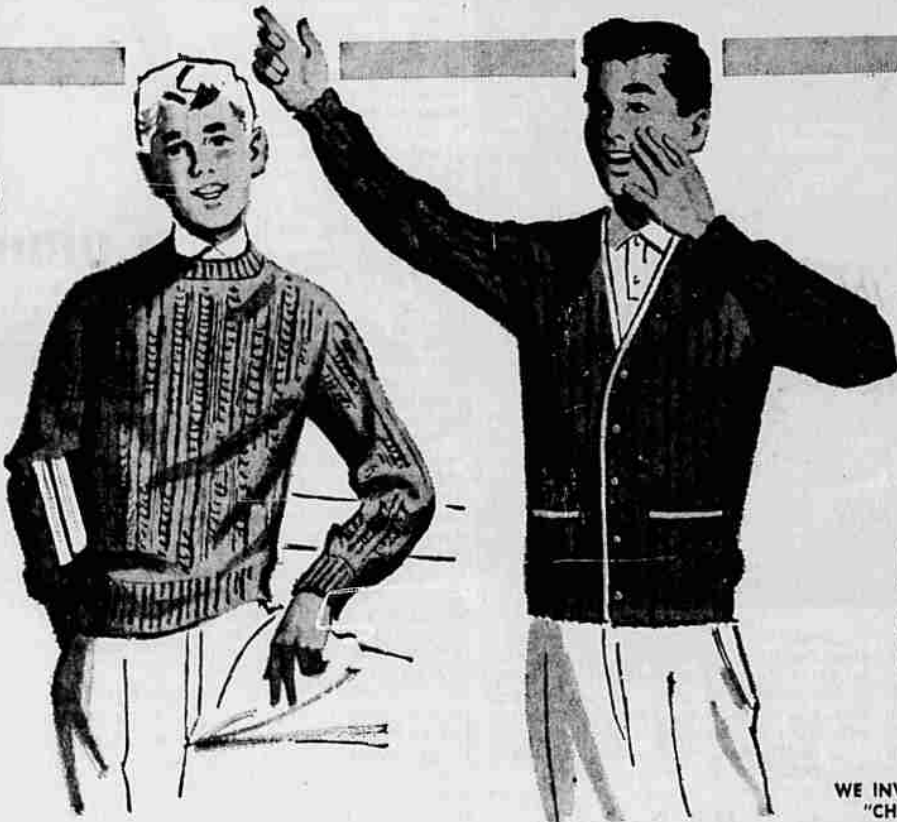
lambswool and Orlon* acrylic bulky pullovers

Bulky knit in three styles . . . solid color crew neck, marle tone square neck and random knit boat neck. Boys' sizes SML.