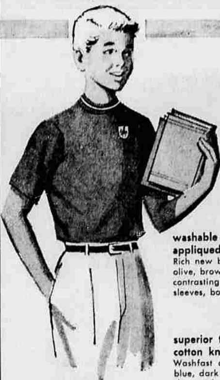
washable cotton jersey applied knit shirts Rich new burnished tone colors — olive, brown, dark gold, red—with contrasting crew neck. Hemmed sleeves, bottom. 12-18.