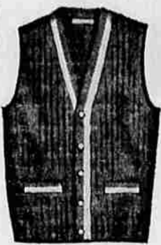
Orlon* acrylic vest

Two-pocket, sleeveless style in bulky stitch. Solid colors with contrasting trim. 8-18.