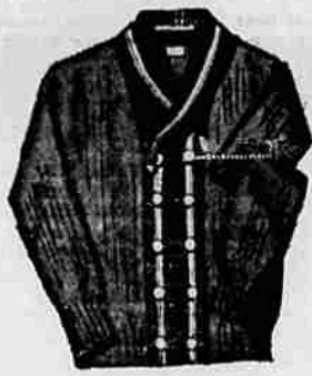
bulky coat sweater

Orlon* acrylic double breasted roll coat style in solid color. Sizes 8-18.