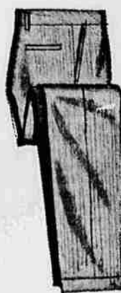
100% cotton cord

Wash 'n' wear slacks with flap pockets, separate waistband. Tan, black, light blue. Sizes 8 to 18.