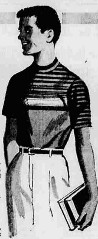
superior type vat-dyed cotton knitted shirts Washfast colors—red, dark green, blue, dark gold — in a crew neck shirt with taped shoulders. Sizes 12 to 18.