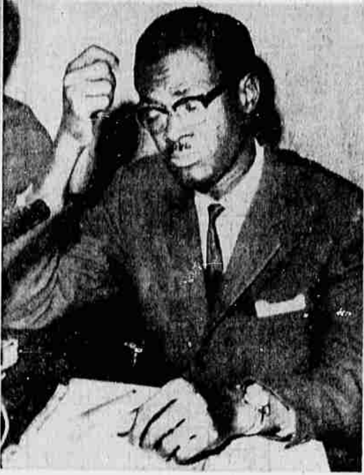
QUIZZICAL — Congo Premier Patrice Lumumba appears quizzical at a press conference Thursday at which he renewed in vague terms his threat to request Soviet troops if the U.N. fails to restore order to his trouble-torn new nation. Lumumba accused newsmen of pushing him into saying it. He is in Washington for a round of talks with U.S. officials.