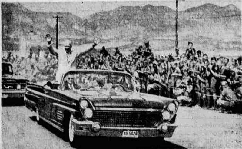
SURPRISE FOR SCOUTS —President Eisenhower waves from his open car as he tours of the Scouts and stopped briefly at the National Boy Scout Jamboree site at main gate to be presented with a Scout Colorado Springs Thursday. He made the neckerchief.

Salem - An Oregon Agriculture department spokesman said today that the department's watch at Oregon airports for possible entry of the dread Japanese beetle has yielded 11 of the insects at Portland airport. But they were all dead when they arrived on inbound planes.