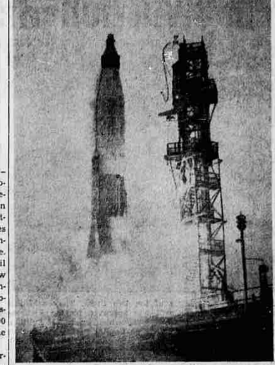
SPACE TEST FAILS —The first major test of the Mercury space capsule riding aboard an ICBM Atlas missile met failure about six miles off Cape Canaveral today when the booster exploded and the missile and capsule plunged into the Atlantic. Above photo was taken just before launching.

Los Angeles - (UPI) - A Minnesota ex-convict was called back today to testify about his claim of bargaining with Carole Tregoff over the price to kill her co-defendant's wife, socialite Barbara Finch.