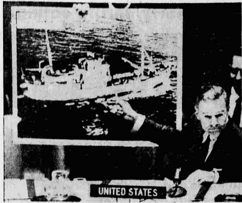
RUSSIANS SPY SHIP —U. N. Ambassador Tuesday, Lodge recounted details of espionage activities by Soviet planes and "trading vessels" plying the Atlantic coast between Cape Cod and Cape Henry.