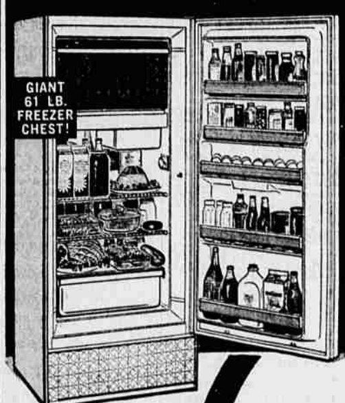
GIANT 61 LB. FREEZER CHEST!

These Low Prices Do Not Include Leonard Electric's Big Trade-in Allowance