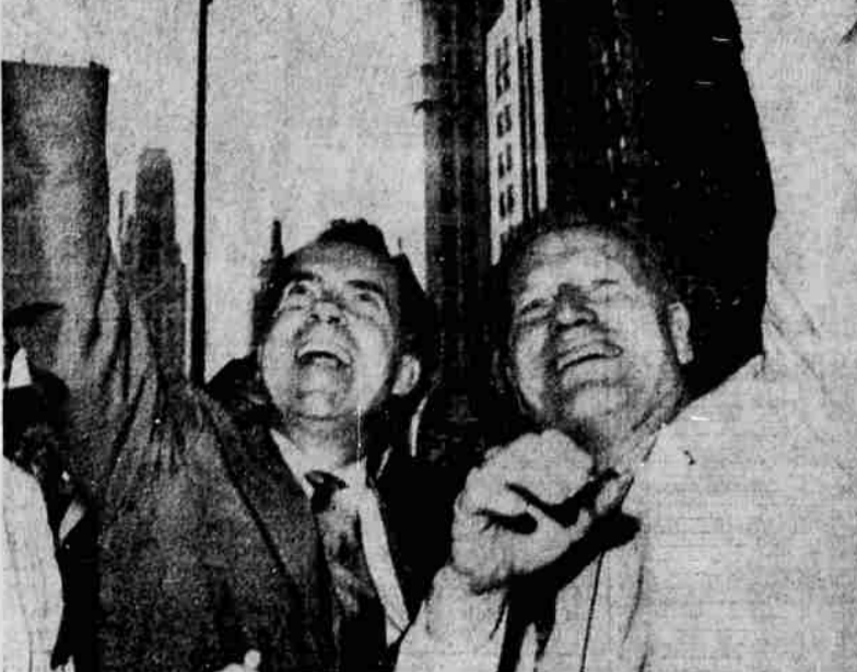
TOGETHERNESS - Smiling Republican leaders Vice President Richard Nixon and New York Governor Nelson Rockefeller breakfast with the California delegation. Rockefeller agreed today to campaign for Nixon from coast to coast in the forthcoming campaign.

Chicago - (UPI) - The Republican vice presidential nomination should be open to all comers - Oregon's 22-vote delegation decided today.