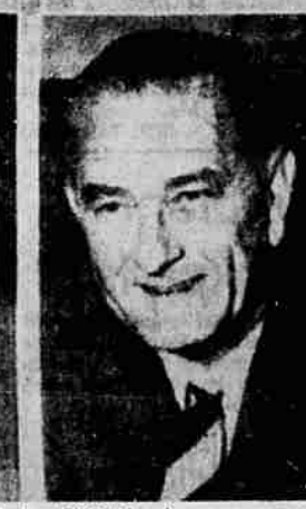
WHOSE HANDS? —Can you match the hands with the faces? The faces (from left) are Vice President Richard Nixon, U. S. Ambassador Henry Cabot Lodge, Democratic Presidential nominee Sen. John F. Kennedy and his running mate, Sen. Lyndon Johnson. The hands are enlargements from photos taken during CBS television appearances by the four men. Give up? The hands belong to Lodge (top left), Kennedy (top right), Johnson (bottom left) and Nixon (bottom right).