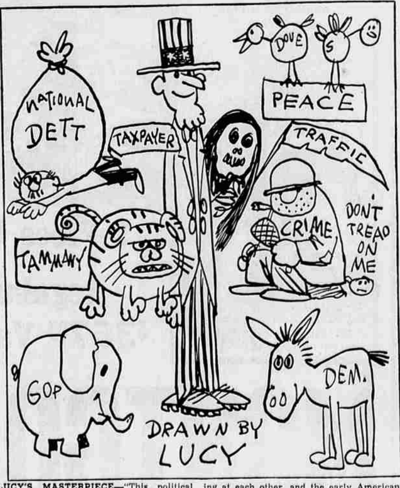
LUCY'S MASTERPIECE—This political cartoon, America's No. 1 Fussbudget told Charlie Brown in the "Peanuts" comic strip last week, "is guaranteed to cure all of the world's troubles!" At first glance, her claim may seem exaggerated. But on second thought, if G.O.P. and DEM. stopped glaring at each other, and the early American spirit of "Don't Tread On Me" came out from behind that rock, and Uncle Sam stopped standing there with his hands at his side, maybe... just maybe... Well, what do you think?

I was surprised, therefore, when the first session, a matinee, ran along generally on time. I was even more surprised when Sen. Karl E. Mundt (R-S.D.), who was scheduled to make a gavel presentation, failed to show up. Mundt is not ordinarily