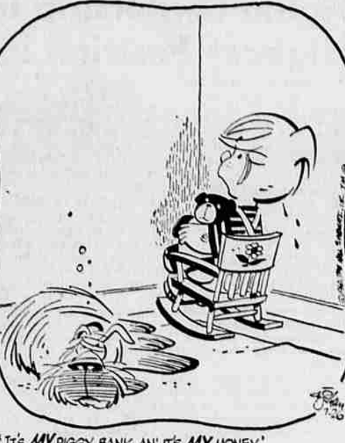
"IT'S MY PIGGY BANK AN' IT'S MY MONEY. THAT'S WHAT I SHOULD SAID!"