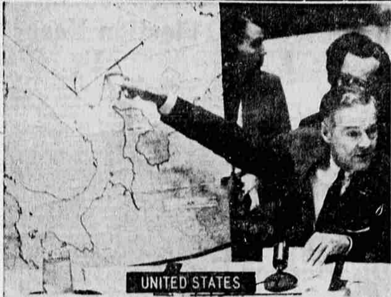
LODGE AND EVIDENCE —U. S. Ambassador to the U.N. Henry Cabot Lodge uses a map with the flight plan of the RB-47 airplane downed recently by Russia as he addresses the Security Council in New York Monday. Lodge charged that Russians tried to force the RB-47 to fly over Soviet territory before shooting it down in international waters. He produced maps and charts to support the U.S. statement that the plane's course never took it closer than 30 miles to Soviet territory.