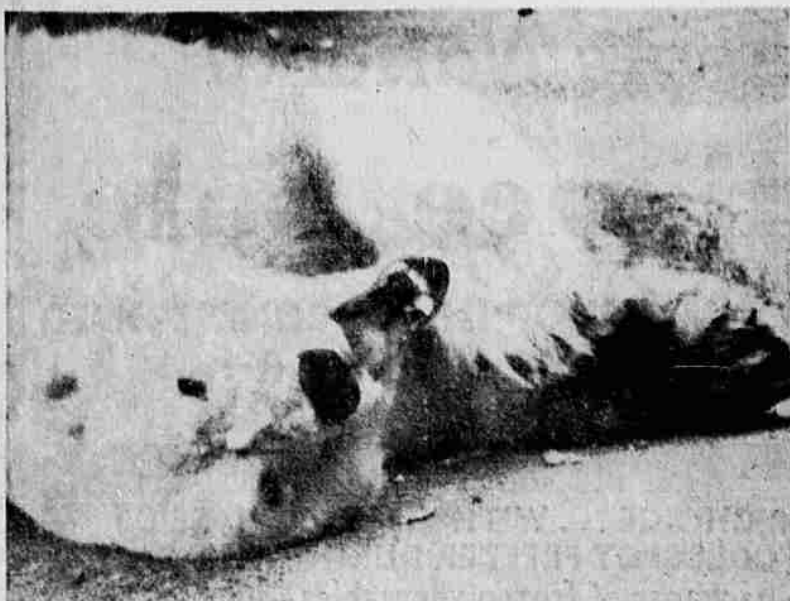
WARDROBE MISTAKE—If you're hot and zoo. The big fellow's yawn probably is his lazy, you should try wearing a fur coat like answer on how to beat the heat. At least this Polar bear at Seattle's Woodland Park he's trying.