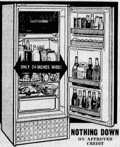
NOTHING DOWN ON APPROVED CREDIT