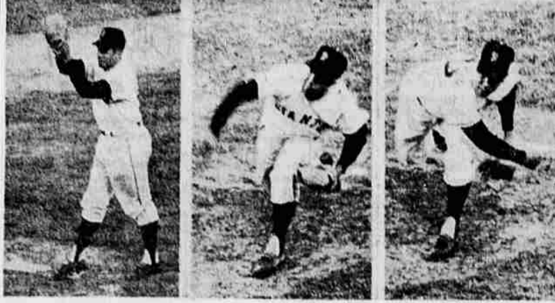
ROOKIE BEATS PHILS — Sequence here shows form of rookie pitcher Juan Marichal of San Francisco Giants whose National League baseball debut against the Philadelphia Phillies here yesterday was sensational. The young pitcher, just up from the minors, got the Phils one hit and one walk. He struck out 12. The Giants beat the Phils 2 to 0.