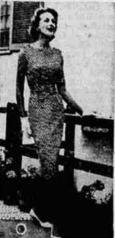
This pretty sheath in cotton will travel anywhere. Buttons on each shoulder accent the scooped neckline, and a wide cummerbund encircles the waist. The frock is not only packable but washable.