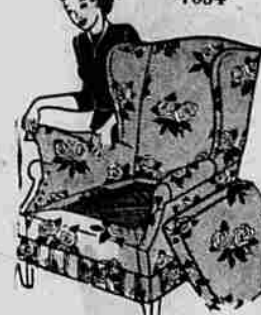
7054 by Alice Brooks

Make old chairs like NEW - do it now with the expert help of this upholstery pattern.