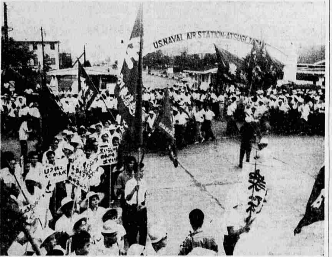
PLANE WITHDRAWAL DEMANDED—Leftist demonstrators staged a protest demanding the withdrawal of U.S. U2 planes from Japan, at Atsugi Naval Air Station at Atsugi, Japan. Japanese Foreign Minister Aichiro Fujiyama has revealed that all American U2 planes stationed in Japan have been withdrawn.