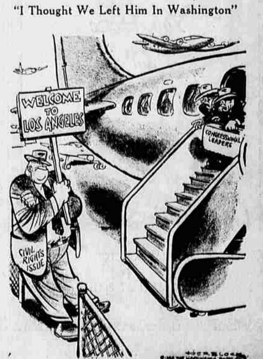
"I Thought We Left Him In Washington"