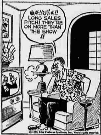
© 1959, The Professional Syndicate, Inc. World rights reserved.