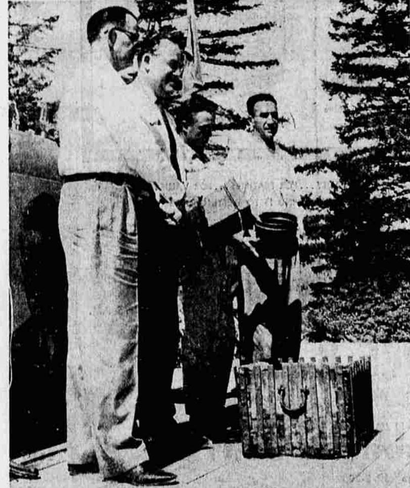
UNITING THE STATES — Officials from California and Nevada pour soil from their states into an old Wells-Fargo strongbox during ceremonies held Friday to launch reconstruction work on nearly 23 miles of the Redwood highway in Del Norte county.