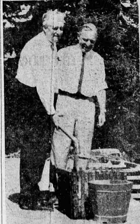
UNITING THE STATES — Officials from California and Nevada pour soil from their states into an old Wells-Fargo strongbox during ceremonies held Friday to launch reconstruction work on nearly 23 miles of the Redwood highway in Del Norte county.

Our Skies Tonight Precipitation Yesterday none. Sunrise today 7:49 a.m. Sunrise tomorrow 7:45 a.m. Moonrise tonight 9:18 p.m.