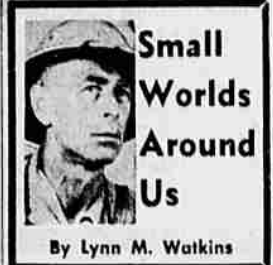
Small Worlds Around Us By Lynn M. Watkins

“The increased output of these new factories and their competitive potential is giving pause to some Western countries but, as a top British official expressed it, ‘The West must buy these goods if we are to continue to give employment and contentment to families that have fled Communism; otherwise, the West may find itself with nothing but a vast soup kitchen on its hands here.’”