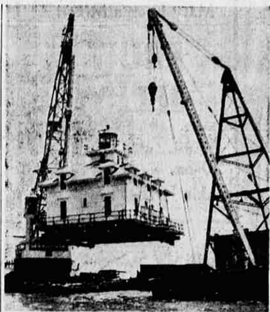
LIGHTHOUSE MOVED —The lighthouse which since 1906 has been warning ships away from the shallow Southampton Shoals in San Francisco Bay, will have a new home on Tinsley Island on the San Joaquin river where it will become a clubhouse for the St. Francis Yacht club. To be replaced with an automatic warning light, the half-century old landmark was moved rather than demolished. Using two huge sea-going cranes, the top two stories were lifted off pilings and deposited on a barge for the trip in an operation that took five hours but didn't even break a window in the old building.

SECTION C MEDFORD, OREGON, THURSDAY, JUNE 30, 1960 PAGES 1 to 12