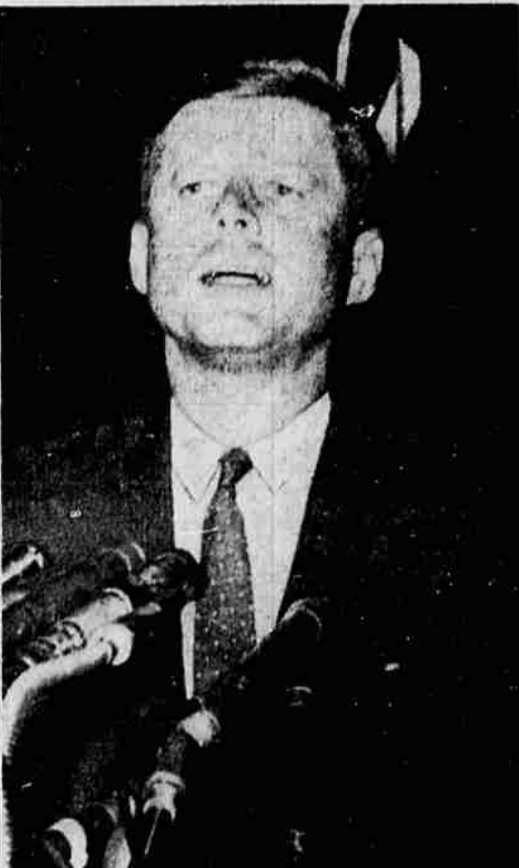
NOT PLANNING TO QUIT —Sen. John F. Kennedy (D-Mass.) told a press conference in New York Monday that he does not intend to step aside at anyone's request in his bid for the Democratic presidential nomination.