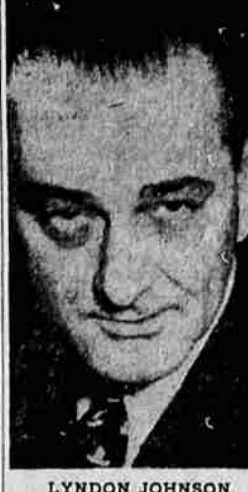
LYNDON JOHNSON Backers Predict Victory

Wednesday he will greet the annual convention of the National Association of State Budget Officers in Salem.