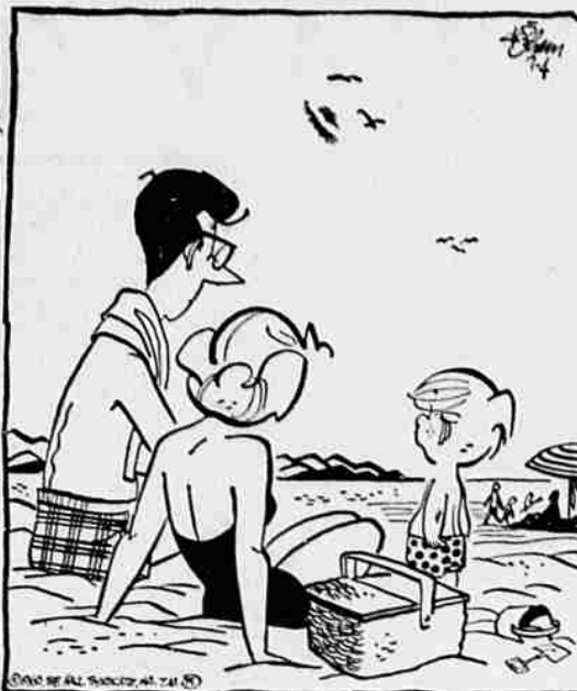
"THE TROUBLE IS ALMOST ALL THAT WATER IS OVER MY HEAD!"