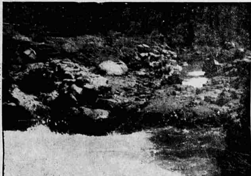
NATURAL BRIDGE —The Natural Bridge and an improved viewpoint complete with stairs leading down to the bridge have been constructed here.