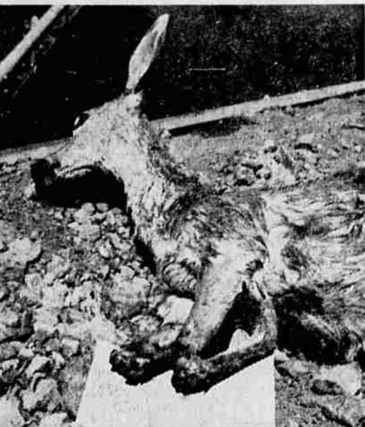
DROWNED DEER —This doe is one of the six deer from the Green Springs herd which have drowned this year in the Howard Prairie delivery canal. Its feet and legs are worn off and bleeding from trying to escape from the canal before it became exhausted and drowned. Should it have escaped, it would have bled to death or been unable to walk, according to local conservationists.

Not Successful "These efforts have not been successful. In considering that matter the Congress did not act favorably on legislation introduced to author-