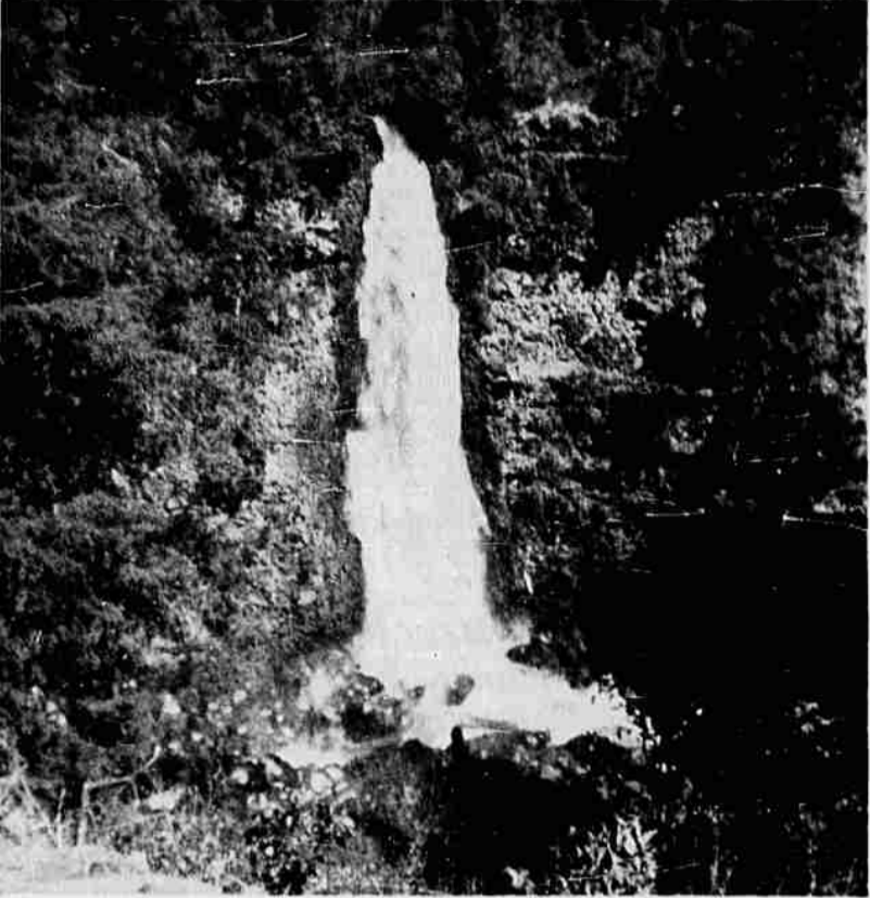
VIEW OF FALLS —Mill Creek falls can be viewed from a marked viewpoint just south of Prospect. A trail leads from the highway to a better and more complete view of the falls.

Rogue River Gorge Just north of Union Creek is the Rogue river gorge. At this point the Rogue river enters a narrow rock gorge where the waters are tossed and churned as they fight their way through the small