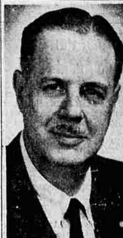
SEN. HUGH SCOTT Republican Speaker