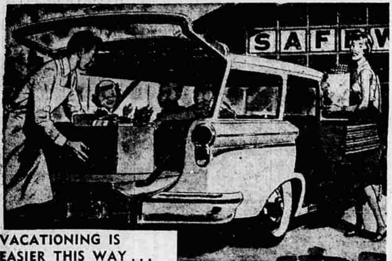
VACATIONING IS EASIER THIS WAY...