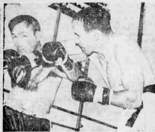
CONNECTS WITH RIGHT—Gene Fullmer throws a hard right to the jaw of Carmen Basilio in middleweight title boxing bout at Salt Lake City yesterday evening. Fullmer kept his crown with a 12th round technical knockout.