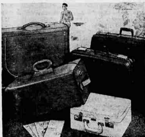
TRAVELERS MUST —Good luggage is a matter of convenience as well as prestige, according to the experienced traveler—and it's fun to go places with new luggage. Shown here are new styles for him and her. His set: a leather twosome of slim 'suiter and Continental club bag; hers: a pair of molded cases made with fiberglass and vinyl coverings. The washable vanity case (front) is a handsome accent.