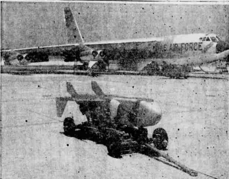
QUAIL DECOYS — A Strategic Air Command B-52G jet bomber launched for the first time Friday three GAM-72 Quail decoy missiles off the west coast of Florida. The Quail is employed as a diversionary missile and is released in coveys in order to confuse enemy air defense by causing multiple darblips similar to the mother bomber.