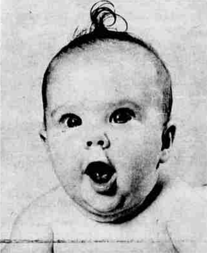
"Oh, you're single and you work here!"