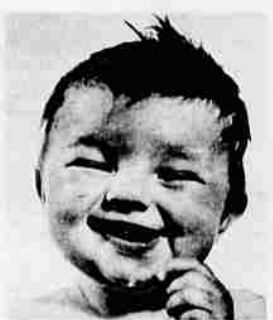
"My opponent has accused me of lacking integrity..."