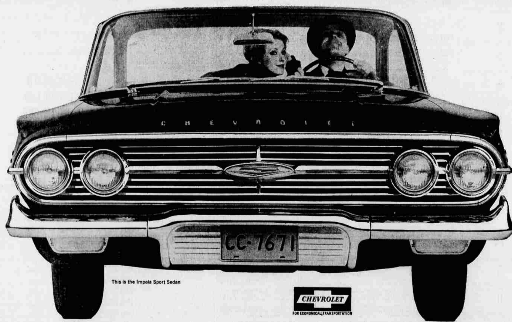
This is the Impala Sport Sedan

Why shouldn't you be driving America's 1st choice car...right now!