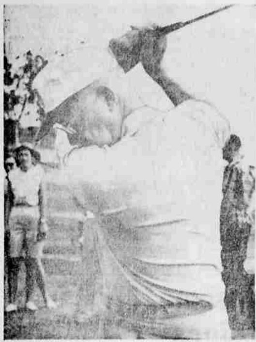
IKE TEES OFF —President Eisenhower is shown on the practice tee at the Kaneohe Marine Air Station golf course at Kaneohe, Oahu, prior to teeing off for a round of golf. The Chief Executive arrived Monday for a short period of rest and relaxation after his trip to the Far East.