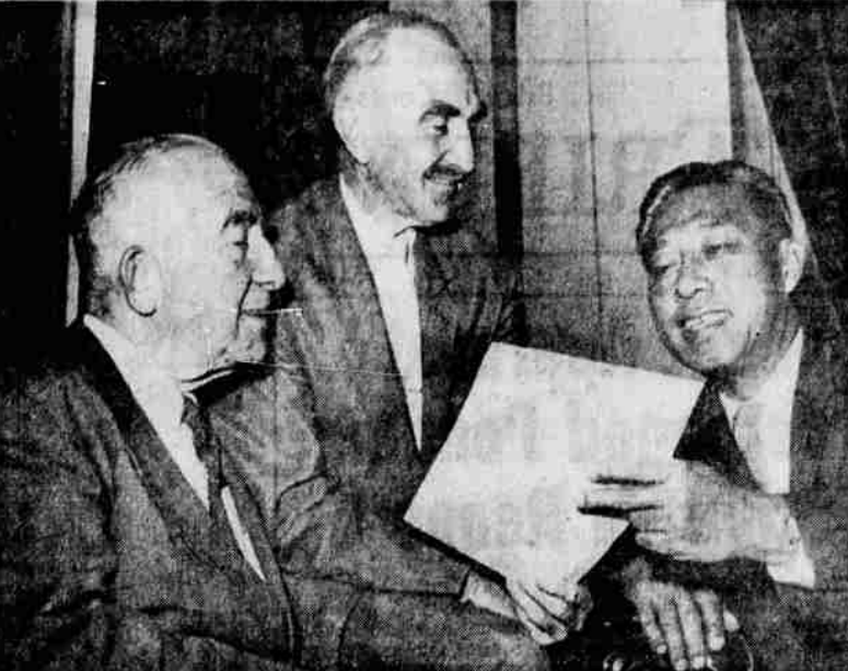
TREATY NOTES COMPARED - These three senators, from areas which were most exposed to Japanese attack during World War II, compare notes on the Japanese Peace Treaty which the Senate is considering for ratification. From left, they are Ernest Gruening, (D-Alaska), Wayne Morse (D-Ore.) and Hiram L. Fong (R-Hawaii).