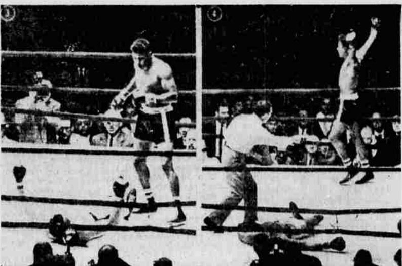
HITS CANVASS —Arms outstretched, Ingemar Johansson hits the canvass, left, as Floyd Patterson starts to a neutral corner in Heavyweight title boxing bout at New York on Monday night. The end comes, right, as referee Arthur Mercante finishes the count down. Patterson jumps with jubilation on regaining the world crown he lost to Ingo a year ago.