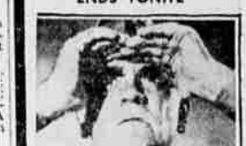
JAMES CAGNEY AS ADMIRAL HALSEY