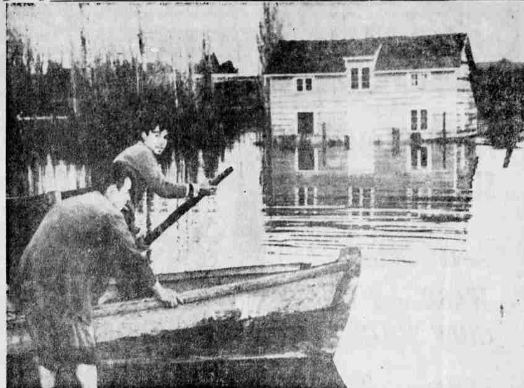
BOATS FOR TRANSPORTATION—Residents of Valdivia, Chile, use boats to get around the city and survey the damage that was done to their property in the recent earth-

quakes that rocked the area. Valdivia was among the hardest hit cities in the series of quakes that shook the South American country.