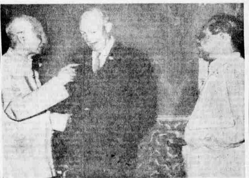
DISCUSSION IN MANILA —Former Philippine President Sergio Osmena, left, makes his own meeting and presented an aide a point in his discussion with President Eisenhower, center, and Philippine President Carlos Garcia at Malacanang Palace in Manila. Osmena met for a time with Eisenhower and Garcia after the two held their own meeting and presented an aide memoir to support Filipino claims for pay adjusments the Manila government contends the United States still owes veterans for wartime service.