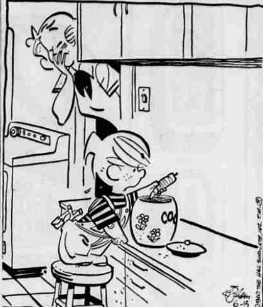
*WHO THE HECK WOULD PUT AN OX CARROT IN THE COOKIE JAR?*