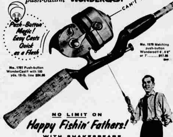
No. 1578 Matching push-button Wonderod 8', 9' or 7'.....$15.95

NO LIMIT ON Happy Fishin' Fathers! WITH SHAKESPEARE