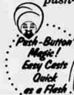
No. 1787 Push-button WonderCast with 100 yds. 12-lb. line $24.95