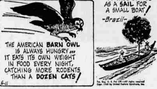
A TREE SERVES AS A SAIL FOR A SMALL BOAT! -Brazil-

FIFTY YEARS LATER, ON THE SAME DAY OF THE SAME MONTH WITH VICTOR HUGO PRESENT, IT OPENED AGAIN TO A LARGER AUDIENCE THAN THE FIRST TIME!