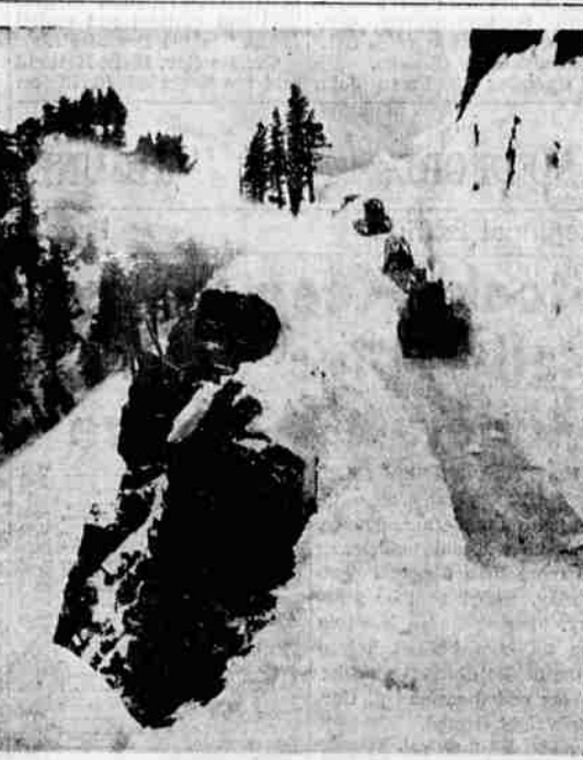
CLEARING ENTRANCE—Bulldozers and rotary snow plow are shown above clearing the rim road at Crater Lake National park so the north entrance road may be open by June 15. Heavy snowfall in April and May handicapped park crews in their efforts to clear the winter's snow from roads and