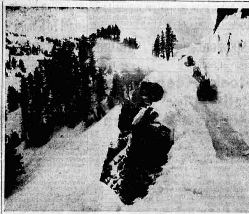
CLEARING ENTRANCE—Bulldozers and rotary snow plow are shown above clearing the rim road at Crater Lake National park so the north entrance road may be open by June 15. Heavy snowfall in April and May handicapped park crews in their efforts to clear the winter's snow from roads and