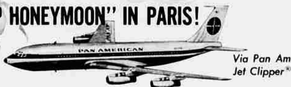
Via Pan Am Jet Clipper®