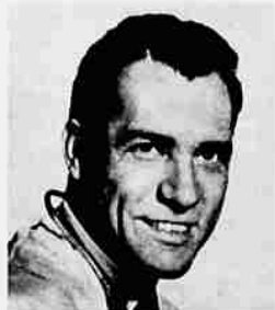
5. Carl Betz