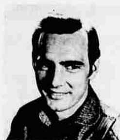
10. Dennis Weaver