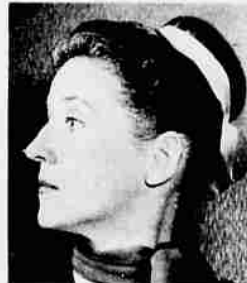
7. Ann B. Davis