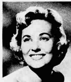
1. Lola Albright

AS THE END of the "live" television season approaches and you brace yourself for a summer of reruns, take this test to see just how observant you've been during the year. Most of the TV faces on this page will probably be familiar to you; they all play secondary roles on regular weekly programs. But can you identify the programs and the parts these performers play? If you get eight out of 10 correct, you qualify as an expert, while five out of 10 is a good score. For the correct answers, turn to page 20.