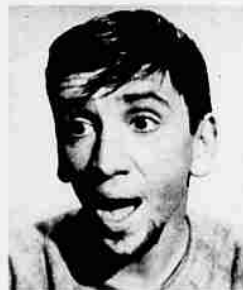
3. Bob Denver