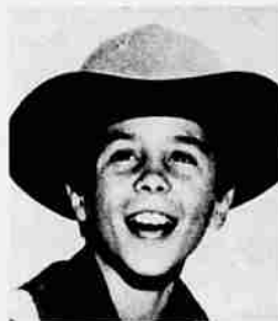
2. Johnny Crawford