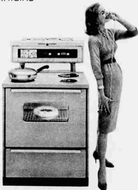
Model J308 Range Dept., General Electric Co., Louisville 1, Ky.

Oven door lifts off! No stretch cleaning! Broiler unit pulls out—bake unit lifts up for easy cleaning.