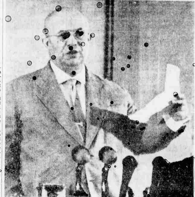
SAYS IKE 'DANGEROUS' —Soviet Premier Nikita Khrushchev gesticulates during a Kremlin press conference in Moscow today.