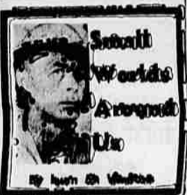
Photo of a man, likely related to the 'Complete Search' article.

The photographs over the Soviet Union and China apparently are to be processed. The satellite is programmed to take 100 pictures a day.